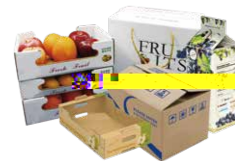
Personalized & customized designs